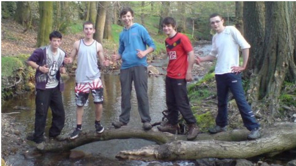
On the 18 th of April eight of our young men set off on their Silver Duke of Edinburgh expedition. On the 20 th of April only 7 returned!